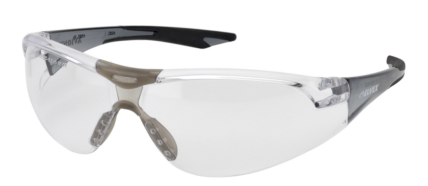
Clear with Black Temples

Our "Flagship" unitary lens spectacle with premium comfort and performance.